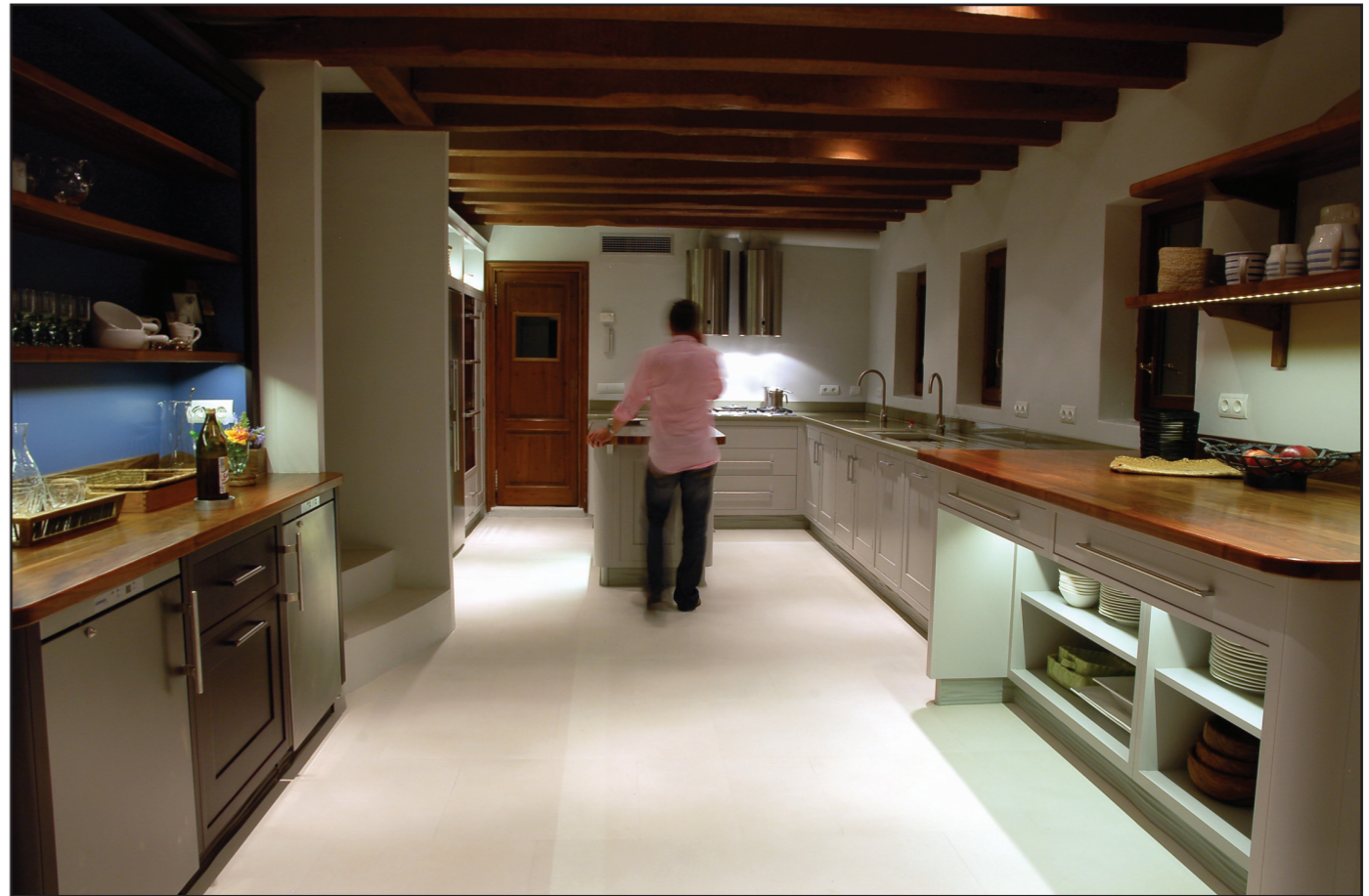
A Guild Anderson kitchen recently installed in Ibiza. Every project Guild Anderson works results in a unique creation.

3,060 mm x 1,260 mm, it can cope easily with large workpieces.