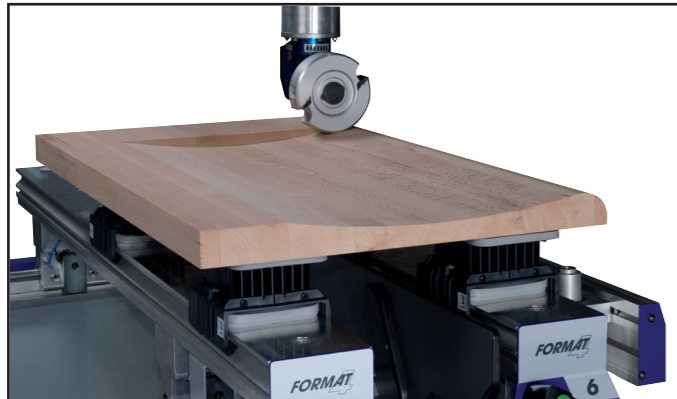
Nick Anderson is looking forward to exploring the Profit H 22's capabilities in producing complex products.

The Profit H 22 CNC machining centre is one of nine CNC machines produced by the Felder Group. With a working area of